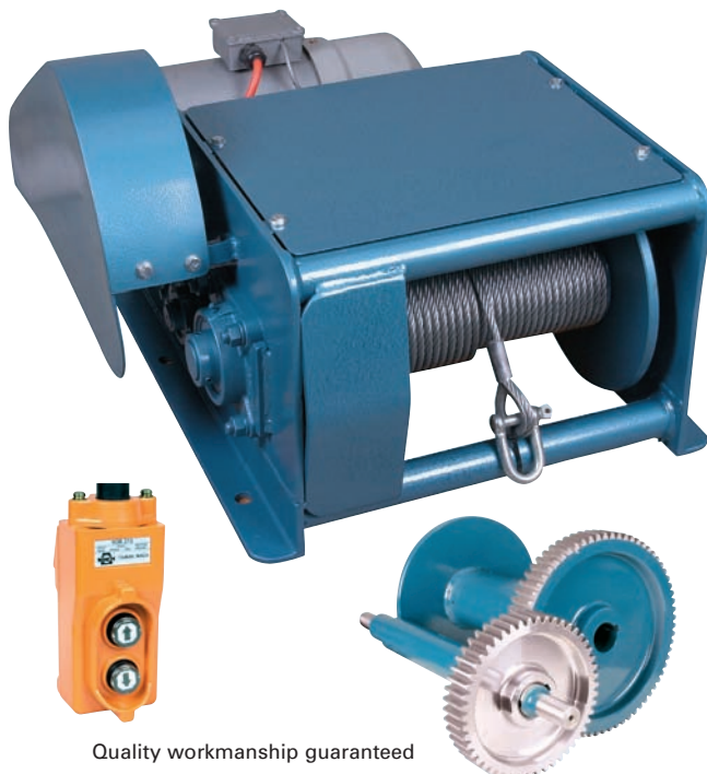
Quality workmanship guaranteed

* Standard boat ramp angle Note: Based on rolling load over good quality surface.